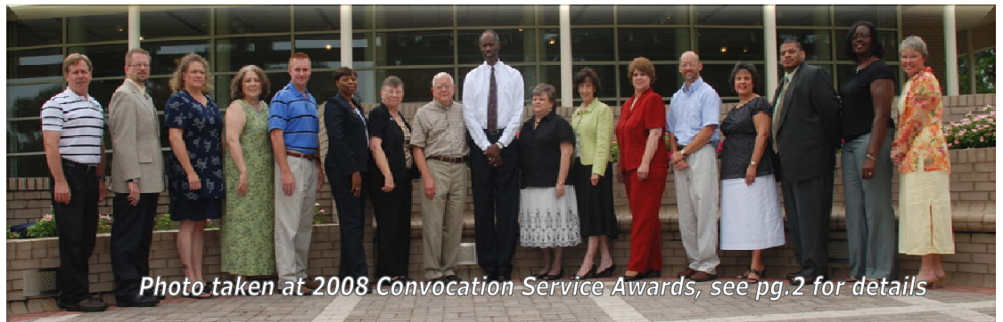
Photo taken at 2008 Convocation Service Awards, see pg.2 for details